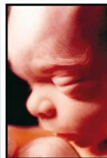
20-week baby in the womb

"Before I formed thee in the womb of thy mother, I knew thee."